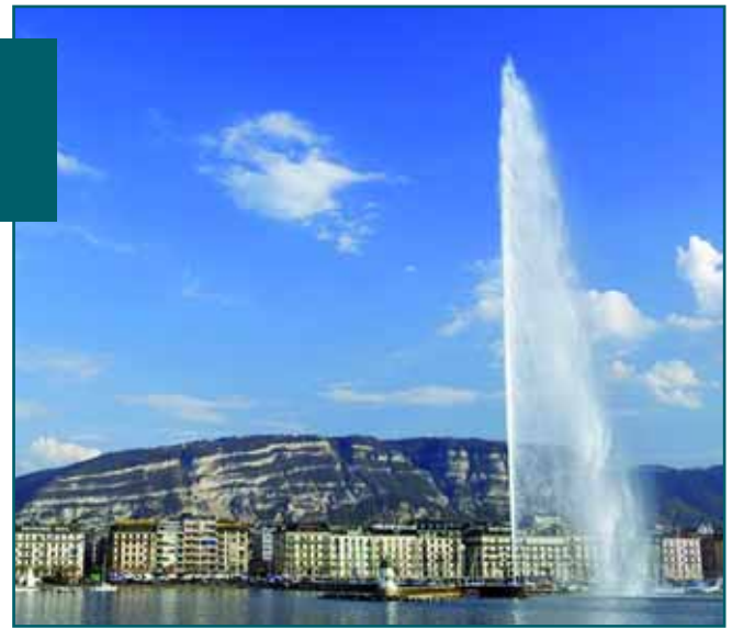
Geneva - easy to reach by train or bus

The pioneering Mont Blanc rack railway takes you through villages and past breathtaking scenery up to the glacier's edge and local trains and buses make travelling around the region's many other sights effortless.