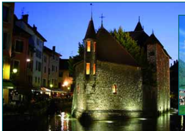
Annecy, the Old Prison at dusk