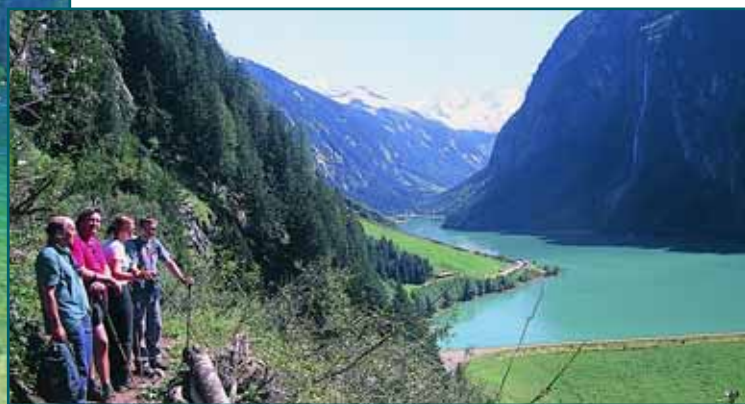
Nearby easy walking