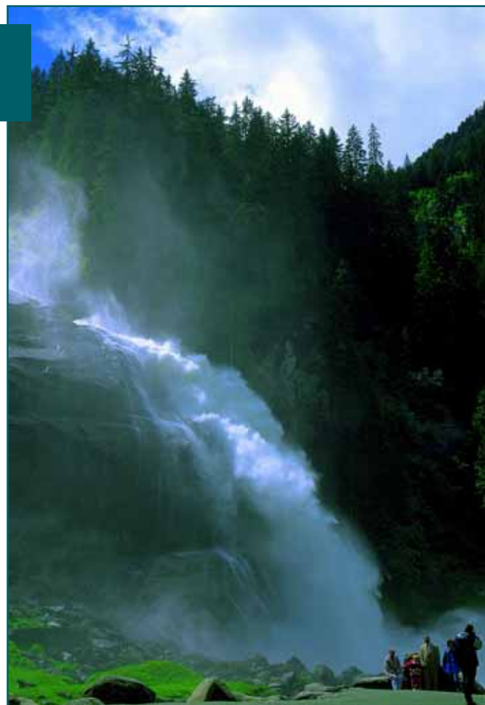
The spectacular Krimml Falls