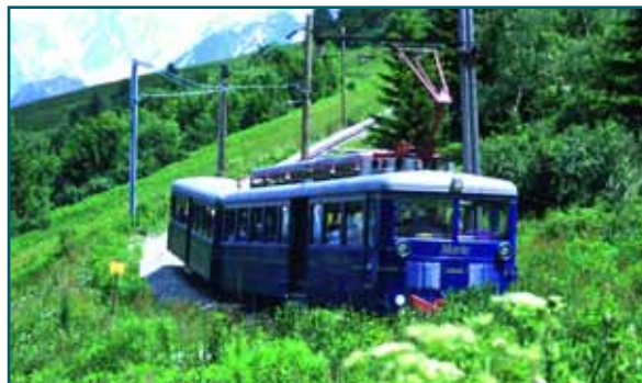
The picturesque Tramway du Mont Blanc passes right outside our Hotel Terminus-Mont Blanc.

Martigny – Enjoy a day out travelling on the incredibly scenic journey to this famous Swiss town – train.