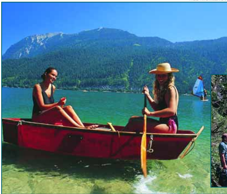
Enjoying the sun on Lake Achensee