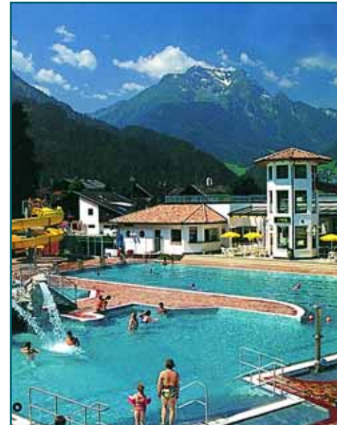
The local swimming pool

Guided Walks. Mayrhofen's tourist office offers an excellent programme of FREE guided walks (local charge for lunches/transport). There are normally four walks per week (high-season) plus a guided bike tour.